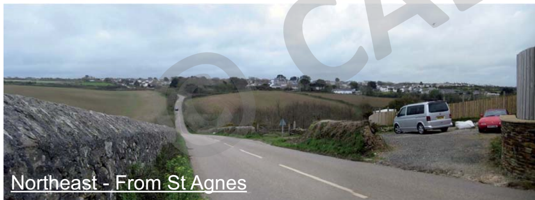
Northeast - From St Agnes