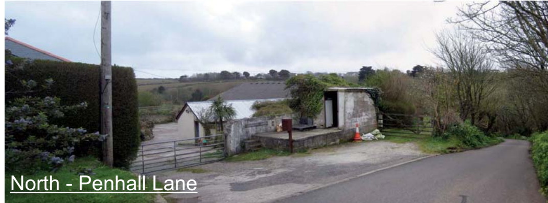
North - Penhall Lane