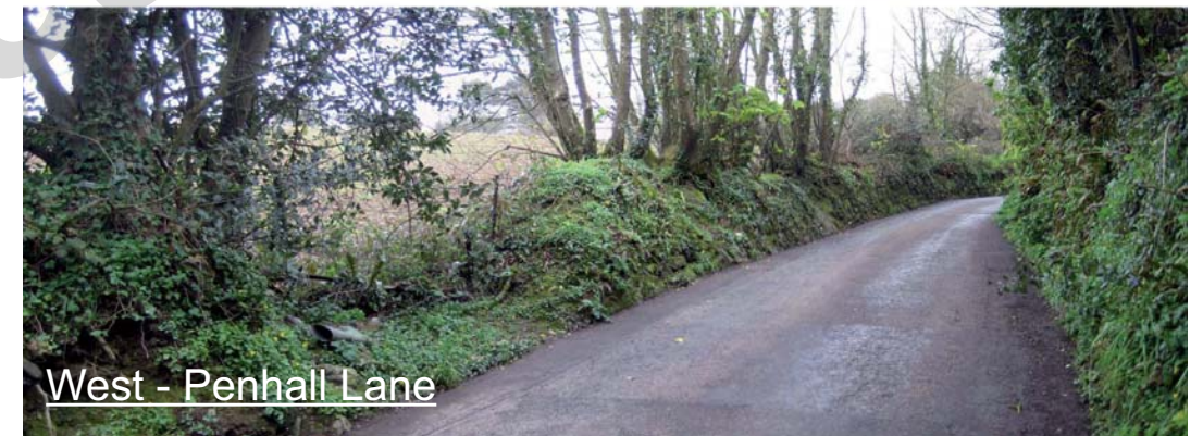
West - Penhall Lane